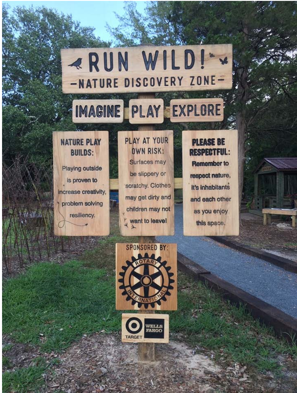
Run Wild at the Zoo - a new sign posted. Note the "Sponsored by Rotary International" sign.