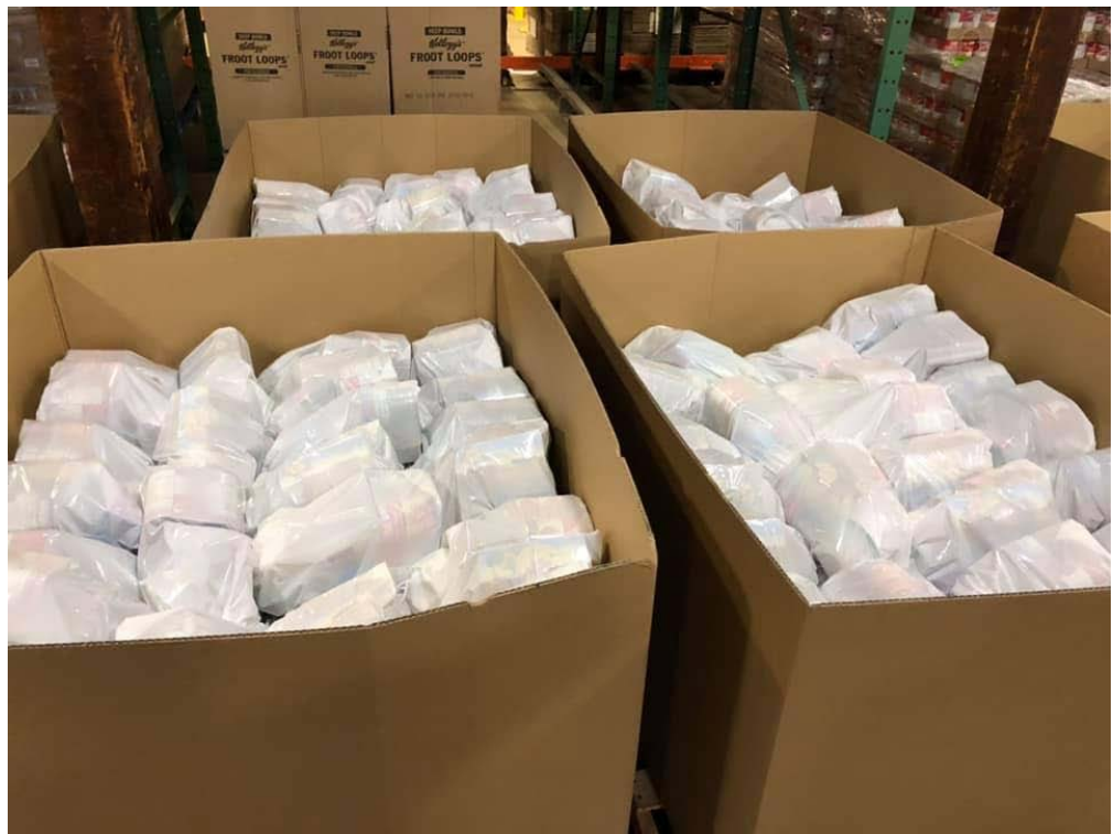
Short Pump Rotary club members spent a fun afternoon packing weekend backpacks of food for FeedMore's school backpack program - 1,000 kids across the metro area now have a supply of food for this weekend. One of the many great FeedMore programs!