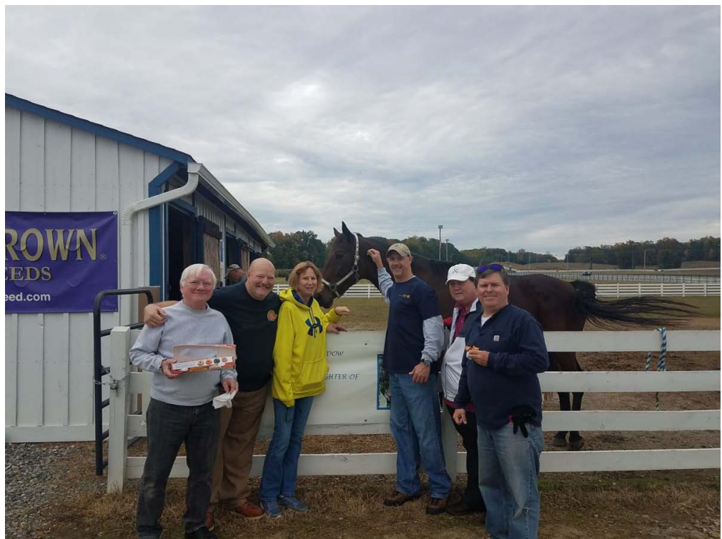
In early October, West Richmond Club members held a service project to help the Secretariat Heritage Center and got to meet Virginia royalty ... Secretariat's great granddaughter.